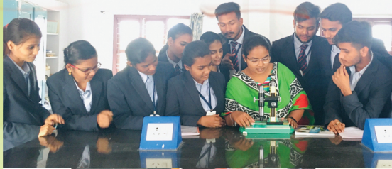
Well furnished Labs